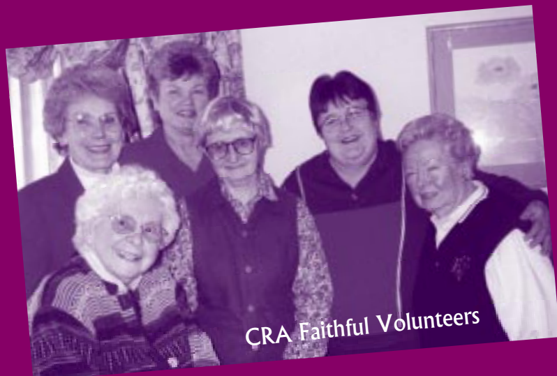
CRA Faithful Volunteers